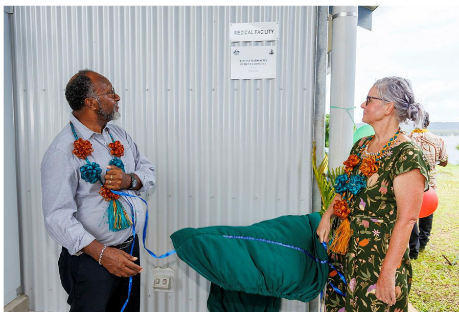
The Honourable Charlot Salwai Tabimasmās, Prime Minister of Vanuatu and Her Excellency Heidi Bootle, Australian High Commissioner to Vanuatu unveil the official opening plaque of the Vanuatu Mobile Force Treatment Centre at Tiroas Barracks in Santo.

“Vanuatu will continue to experience natural disasters and having such facilities will boost the morale of the Vanuatu Mobile Force.”